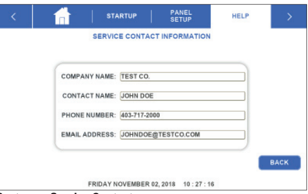
Customer Service Contact