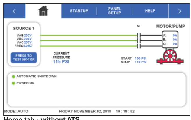
Home tab - without ATS