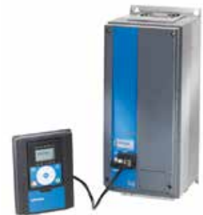
Keypad door mounting kit