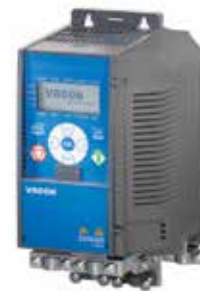
Option board mounting kit